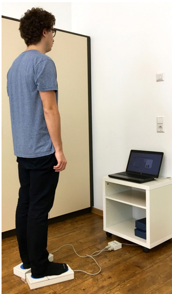
Fig. 3. Assessment of postural regulation and stability characteristics using Interactive Balance System.