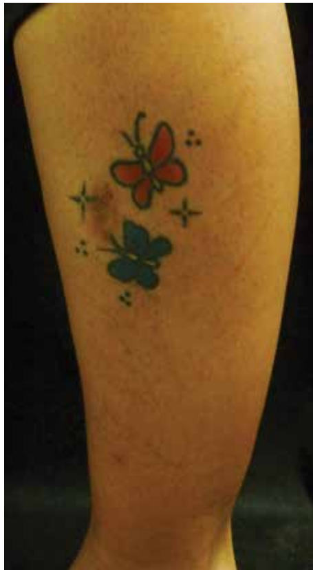
FIGURE 1: Erythematous plaque little infiltrative capacity on the tattoo site

Histopathology showed a granulomatous inflammatory infiltrate composed of lymphocytes, histiocytes, epithelioid cells and giant Langerhans-type