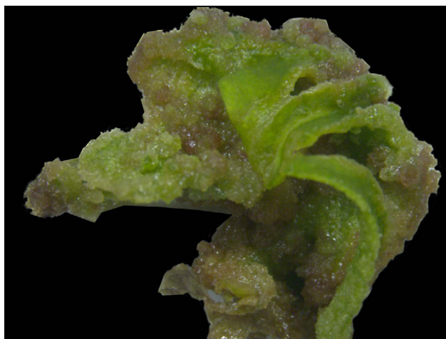
Figure 2. Callus developed on a leaf explant in MS medium with 11.00 \mu\text{M} 6-BA, 1.20 \mu\text{M} IBA and 1.80 \mu\text{M} 2,4-D, which appeared the browning of the callus during subsequent culture.

Medium Number 1 (Tab. 2), containing no growth regulators, produced an average of 2.22 shoots; regeneration percentage was 9.03%. Media containing