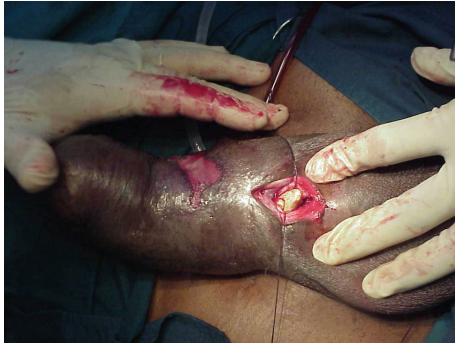
FIGURE 1: Urethral stone exposed via ventral approach.