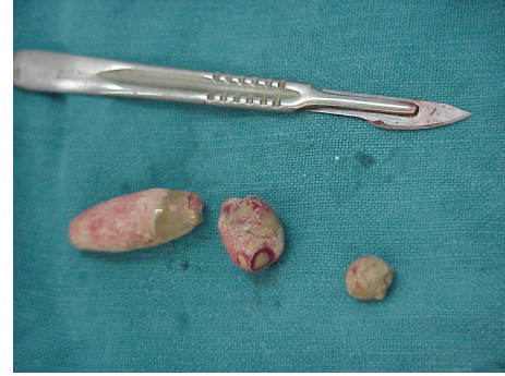
FIGURE 4: Multiple extracted urethral stones.