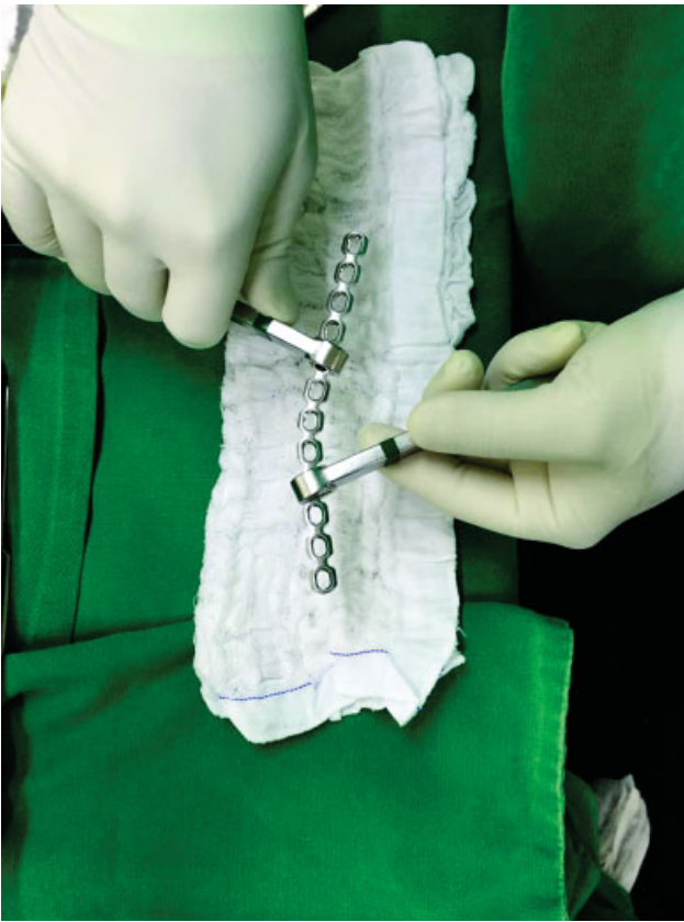
Fig. 3 Plate modeling.

determined at radioscopy. The plate was slipped in the supraclavicular tunnel from medial to lateral, with the scapula kept in a retracted position. Provisional fixation was performed with 2.5-mm Kirchner wires (for length evaluation under radioscopy), and the plate was fixated with 3 bicortical screws on each side, alternately, starting from the medial side. Reduction and final plate and screws positioning were verified (► Figure 4 ). Wounds were irrigated with 0.9% saline solution; deep layers were closed with 3.0 mononylon sutures followed by 2.0 intradermal sutures.