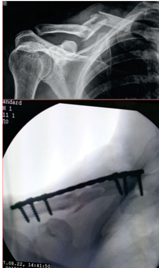
Fig. 4 Before and after fixation with the minimally invasive osteosynthesis (MIO) technique.

For statistical analysis, descriptive data was expressed as frequency, mean and standard deviation (SD) tables. The Fisher exact test analyzed associations between categorical variables. Paired t-tests compared the operated and nonoperated sides for continuous numerical variables. Error normality was analyzed by box plot, quantile-quantile graph