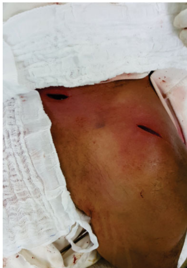
Fig. 2 Medial and lateral incisions.

Surgical technique (adapted from Jung et al. 18 ): patient in the beach chair position; the procedure was aided by radioscopy in frontal and modified craniocaudal views of the clavicle with an approximate inclination of 70° (► Figure 1 ). A fracture reduction maneuver (the Kibler maneuver) was performed; the surgeon put the ipsilateral arm to a posterior, slightly superior position, with lateral rotation of the shoulder, approximating the scapula to the rib cage with lateral, superior rotation and posterior scapular inclination (a position mimicking retraction), leading to the indirect clavicle fracture reduction. Using radioscopy, the clavicular length and shape were determined to choose the implant size (3.5-mm, unlocked reconstruction plate). Next, the medial and lateral ends of the clavicle were palpated to locate the sternal and acromial borders, respectively. A transverse incision 1 cm lateral to the sternal border, with ~ 1.5 cm, was performed on the upper surface, with deep plane