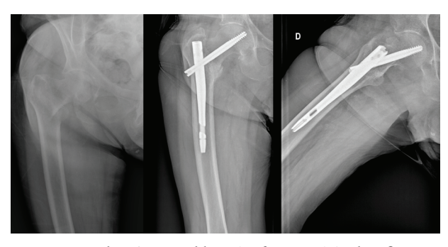
Figure 2. Male 85 years old, 31A1 fracture AO classification, healing at 6 months