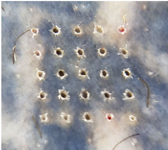
FIGURE 3 Ablation holes over a tattooed area as seen through dermatoscopy (dermatoscopic photograph from a patient not related to this study, Courtesy of Fotona)