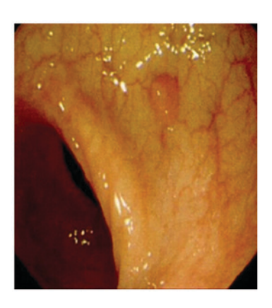
Figure 1. Colon polyp endoscope.