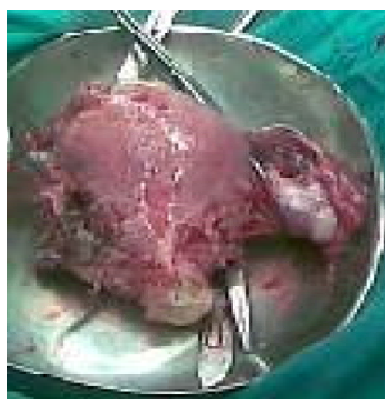
Figure 2. Enlarged uterus, ovarian metastasis, perforation of uterus, and myometrium invasion