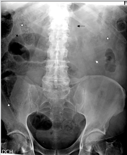
Figure 1. Simple abdominal x-ray (AP view) showing: intestinal fecal remains (white arrowheads). The lower border of the left renal silhouette (small white arrow) and absence of the right renal silhouette. The sentinel loop sign (small black arrow). The effacement of the left psoas line at its upper limit (long black arrow).