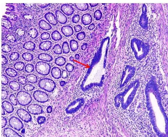
Fig. 3 Sections from the rectum specimen showed endometrioid structures between the rectal muscle walls (red arrow)

recto-sigmoid mass and multiple adenomyoma of the uterus. The mass had adhesion with the posterior lamina of right broad ligament and the posterior uterine wall, without infiltration into the rectovaginal septum (Fig. 2).