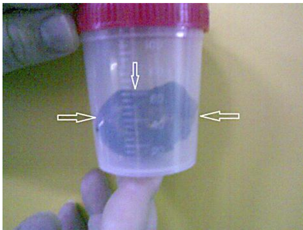
Fig. 2. The gallstone (arrows) causing the obstruction.