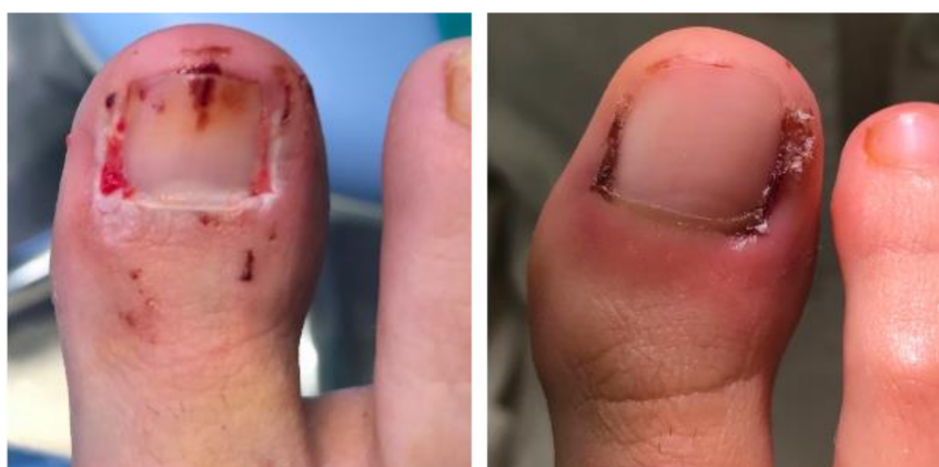
Figure 3. Appearance of the wound at 13 days post op. To the left, granulation tissue is still visible (control group; 60 s). On the right, the granulation tissue has disappeared (experimental group; 30 s).

The primary outcome measurements were healing time. The healing time was measured as previously described criteria [2,18,19], considering the period of time between ending surgical procedure and resolution of the postoperative period. These criteria were absence of exudate at gauze; formation of scab covering the wound; the wound must be kept uncovered; no signs of infection or inflammation at nail folds; no signs of erythema or hypergranulation tissue (Figure 3).