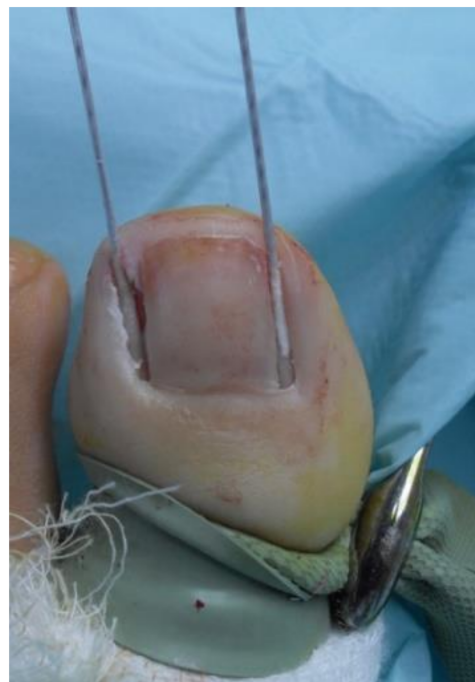
Figure 2. Cotton Swab 88% phenol soaked applied at both sides of matrix and the nail bed for 1-min at control group.

Afterwards, a cotton swab was soaked in 88% phenol and then applied at both nail matrix and nail bed of hallux for 1 min at control group (Figure 2), and for 30 s at the same places of contralateral hallux as the experimental group.