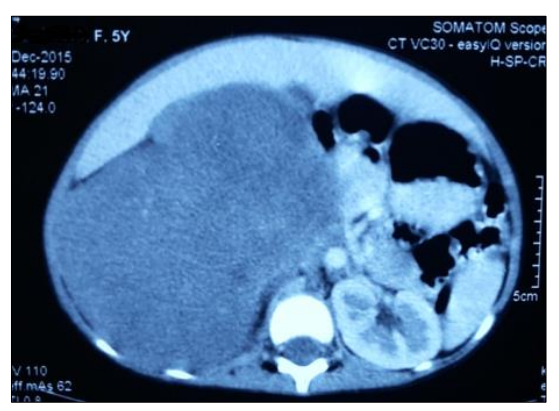
Figure 1: CECT showing right renal mass.

with clinical and ultrasound examination to look for any recurrences. Child is doing well on follow up with no evidence of recurrence in last five months.