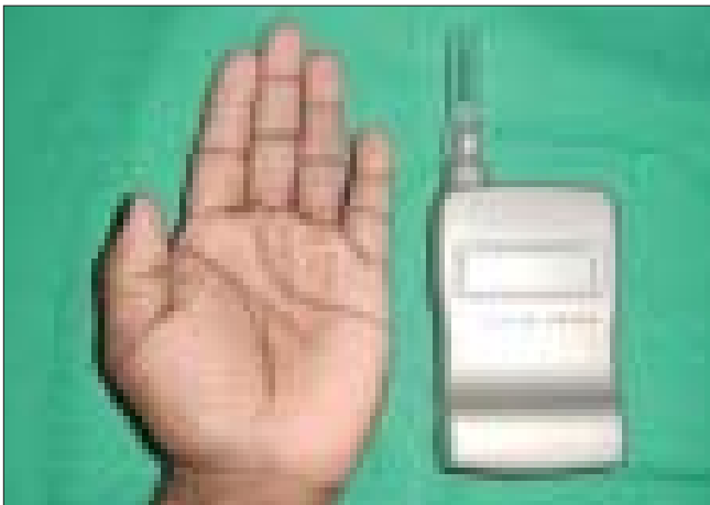
Figure 1: "Digital breathalyzer" (Sharper Image - USA)

Blood ethanol levels were measured with a "Digital breathalyzer" (Sharper Image - USA) which measures the alcohol content in the exhaled breath and extrapolates the value to the corresponding blood level [Figure 1]. The patients