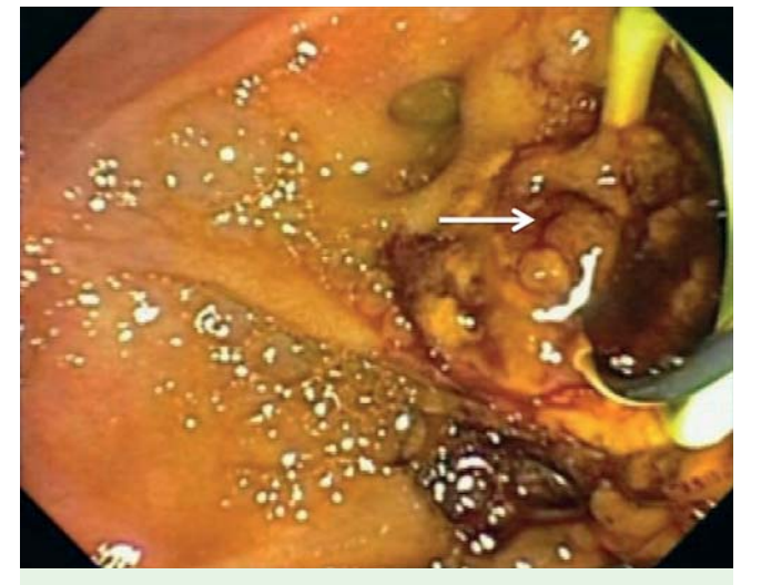
Fig.2 Endoscopic view of the papilla after ampullectomy demonstrating intraductal extension of the adenoma (arrow).

▶ Video 1 presents a synopsis of 2 representative cases. All RFA procedures were technically successful, resulting in a perceptible tissue effect (● Fig. 3). RFA was performed immediately following endoscopic resection in 1 case and during a subsequent session in the remaining cases. The mean number of RFA sessions per patient was 1.5 (range 1 – 3). All patients were discharged uneventfully after the procedure without any immediate adverse events