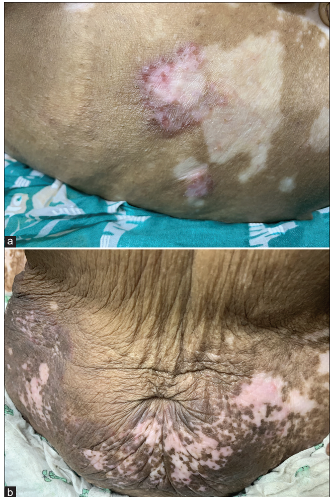
Figure 2: (a): Tinea over vitiliginous skin on the anterior abdomen for the last 1 month; (b): Tinea over vitiliginous skin on the anterior abdomen for the last 3 months

A female patient aged 50 years attended Skin OPD with vitiligo vulgaris for the last 20 years involving the anterior abdomen. There was no Koebner phenomenon. The patient was known diabetic but nonhypertensive. The patient was treated with topical superpotent steroids and calcineurin inhibitors in the past and was receiving no treatment in the present. The patient complained of scaly, pruritic, erythematous polycyclic lesions on the anterior abdomen over vitiligo patches for the last 3 months [Figure 2b]. On skin scraping and KOH mount, plenty of fungal elements were seen. Culture on fungal media showed growth of T. mentagrophytes . She was treated with luliconazole cream and oral terbinafine for 10 weeks with complete resolution of tinea.