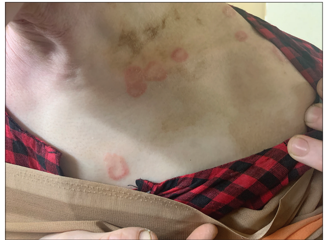
Figure 4: Tinea over vitiliginous skin on the left lower neck for the last 20 days

Vitiligo is associated with many autoimmune diseases. There is well-documented evidence that epidermal dendritic