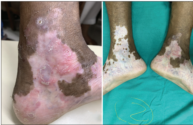
Figure 1: Tinea over vitiligo patches on the left ankle for the last 3 months

receiving no treatment in the present. Scaly, pruritic, erythematous oval lesions with papules at the active border on the anterior abdomen over vitiligo patches were observed for the last 1 month [Figure 2a]. On skin scraping and KOH mount, plenty of fungal elements were seen. Culture on fungal media showed growth of T. mentagrophytes . She was treated with ketoconazole cream and oral itraconazole for 6 weeks with complete resolution of tinea.