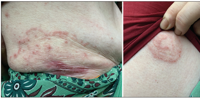
Figure 3: Tinea over vitiliginous skin on the right lateral trunk and right flank for the last 1 month

dermatosis that develops in the same area of skin as another previously present but still active dermatosis. [2]