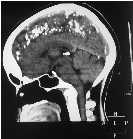
Figure 3: Calcifications of the falx cerebri