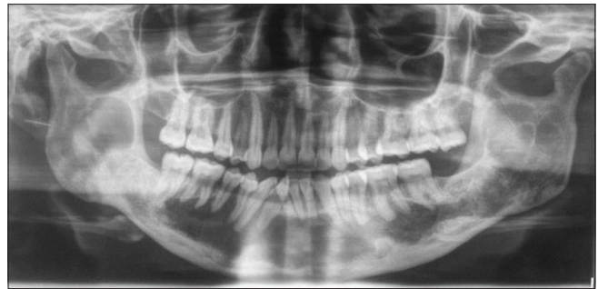
Figure 4: Two years' postoperative

was subsequently gradually removed by 10 cm on either side every fortnight, followed by cystectomy. Two years postoperatively, a decrease in the size and radiolucency of the cystic cavities were noted radiographically [Figure 4]. The posterior lesions (treated by enucleation and irrigation with nonmodified Carnoy's solution) displayed greater resolution than the anterior lesions (treated by marsupialization). Recurrence involving the right mandibular ramus was noted 32 months postoperatively [Figure 5]. At the time of writing, irrigation with nonmodified Carnoy's solution and enucleation of the lesion is planned.