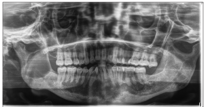
Figure 5: Recurrence 32 months’ postoperative

Al-Moraissi et al. suggested enucleation and irrigation with Carnoy’s solution or cryotherapy as the first-line treatment for primary OKCs, due to low recurrence rates. When marsupialization is indicated, secondary cystectomy should follow to minimize recurrence. Resections should be considered following multiple recurrences and possibly in