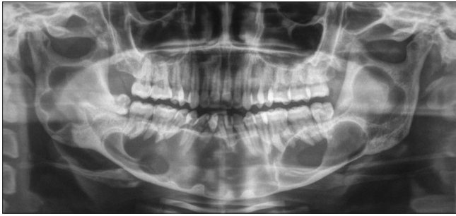
Figure 1: Initial panoramic radiograph