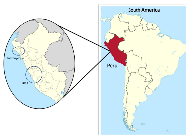
Figure 2. Location of CMHCs Included in the Study. Abbreviation: CMHCs, community mental health centers.

The CMHCs have between 14 and 20 employees each. Staff members are clinicians, including psychiatrists, primary care physicians, psychologists, nurses, social workers, occupational and language therapists; and support personnel including technicians, administrative and security staff. Only clinicians