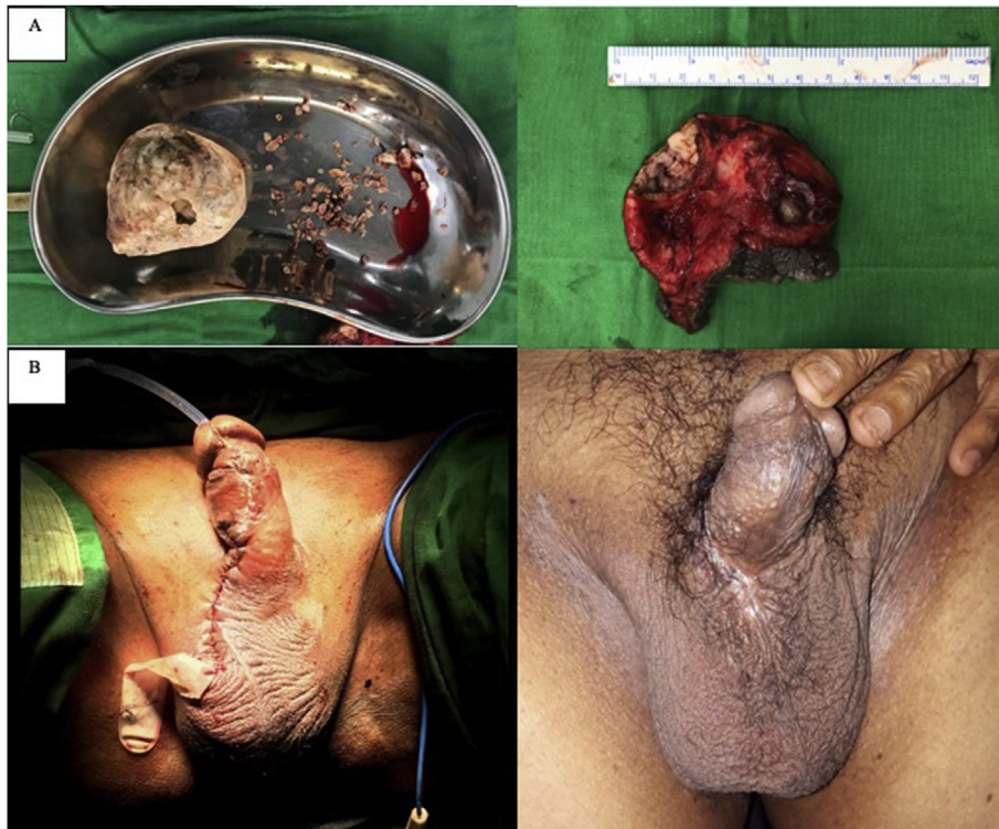
Fig. 2. (A) Intraoperative findings: stones and diverticulum pouch; (B) Postoperative.