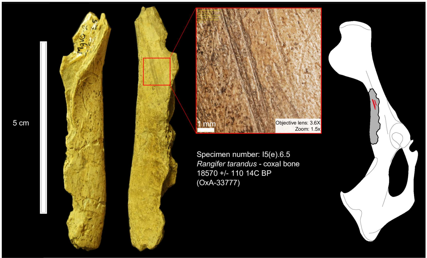
Fig 2. Cut marks on a caribou coxal bone from Cave II. The specimen (# I5.6.5) is dated to 18,570 \pm 110 ^{14}\text{C} BP (OxA-33777) and shows straight and parallel marks resulting from filleting activity.