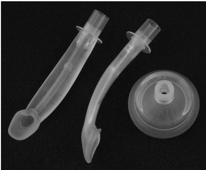
Figure 2 The i-gel and face mask.

Japan) attached to a mount on the resuscitation table. Recording started manually at time of birth and stopped at the end of the resuscitation procedure. The baby, the health providers' hands and the tablet for data recording were continuously filmed with narrow field of view. This allowed precise assessment of time to spontaneous breathing, assistance by supervisor and conversion to alternative device by trial arm. The HR of the patient was collected using the NeoTap app ( www.Tap4Life.org ), a newly developed mHealth software for Android and IOS mobile devices. HR was obtained by advanced users (NJP and CL) auscultating the heart and simultaneously tapping the screen for three beats. HR data at 30 and 60 s after birth are not possible with current pulse oximetry technology.