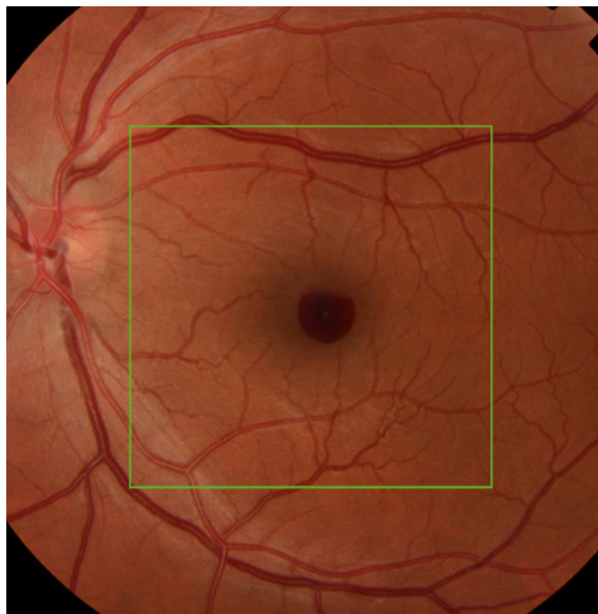
Figure 1 Fundus appearance in the 31-year-old man presenting at the department of ophthalmology due to rapid onset of reduced visual acuity in left eye. A small preretinal haemorrhage in the macula was found.