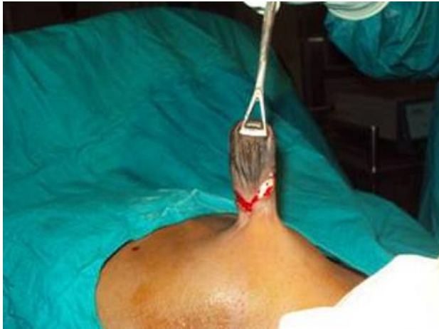
Figure 3: V-shaped cuts leaving two half cones