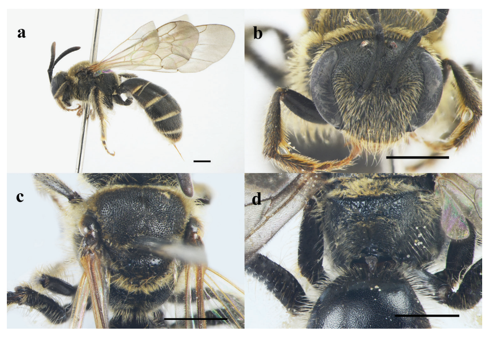
Figure 2. Lipotriches (Lipotriches) guihongi Zhang & Niu sp. nov., female a habitus in lateral view b head in frontal view c mesoscutum in dorsal view d propodeum in posterior view. Scale bars: 1 mm.