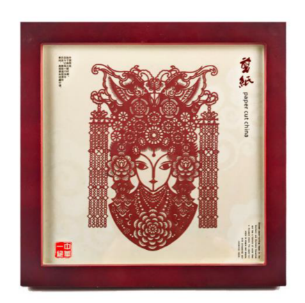
Symmetry-design Chinese paper cutting

FIGURE 3 Picture of ICH souvenir stimuli used in Study 2.