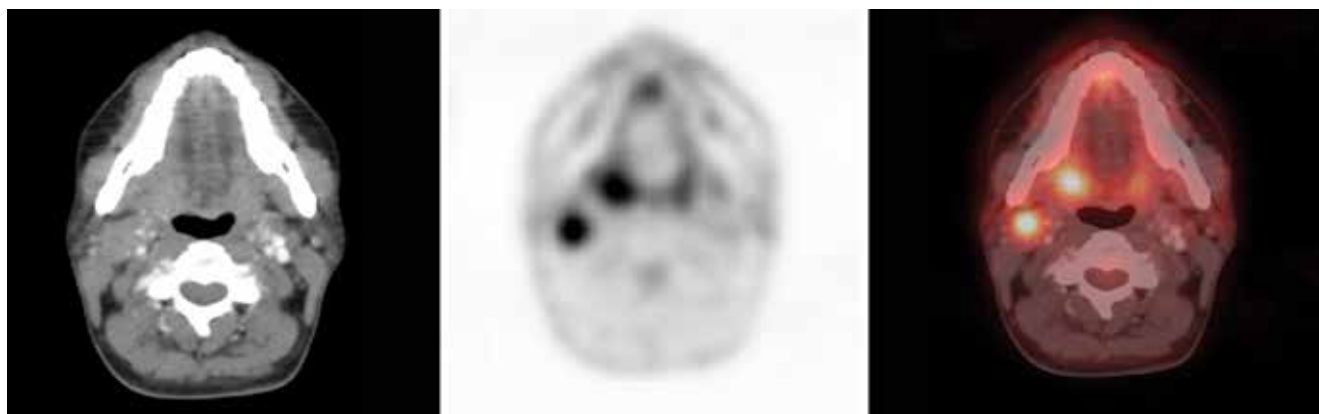
Figure 4. A 39-year-old-female patient with a diagnosis of metastatic squamous cell carcinoma on cervical node biopsy. Axial positron emission tomography-computed tomography and fusion images display hypermetabolic right level II cervical node ( \text{SUV}_{\text{max}} : 5.9) and right tonsillar soft tissue mass ( \text{SUV}_{\text{max}} : 6.5) which turned out to be tonsillar squamous cell carcinoma

In our study, disease stage was modified in 38% of the cases. This is slightly better than the 34.7% stated in a recent review by Pawaskar and Basu (22). Modification in treatment regimen and impact on survival was beyond the scope of our current study. However, in the literature,