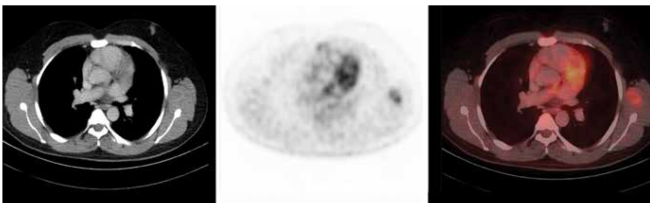
Figure 2. A 46-year-old-male patient with a diagnosis of myelofibrosis on bone marrow biopsy. Axial positron emission tomography-computed tomography and fusion images show hypermetabolic left subscapular soft tissue mass ( \text{SUV}_{\text{max}} : 3.1). Biopsy of the subscapular mass revealed Non-Hodgkin's lymphoma