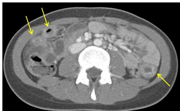
Figure 2 Computed tomography of the abdomen showing an edematous bowel. This image shows multifocal areas of bowel wall thickening, mesenteric edema, and vascular engorgement in jejunum-ileal loops (yellow arrows).

On HD 20, her fever and abdominal pain persisted, and gross hematuria (GHU) developed. Laboratory results showed the following abnormalities: WBC count, 23,600/ \mu L; ESR, 67mm/hour; amylase, 125IU/dL; lipase, 104U/L; and CRP, 6.41mg/dL. The random UP/Cr had elevated to 2.15. The antibiotic was switched to piperacillin and tazobactam to eradicate the infection. A kidney biopsy was performed. Finally, a decision was made to administer high-dose IMPT for 3 days consecutively. The renal biopsy showed an increased glomerulus size, segment hypercellularity, 9% segmental loop necrosis on light microscopy, mesangial deposits on electron microscopy, and IgA 3+ on immunofluorescence microscopy. Overall, the biopsy revealed grade II HSP nephritis according to the International Study of Kidney Disease in Children grading system [7], and HSP nephritis was confirmed (Figure 4).