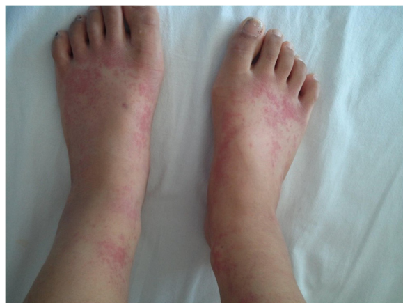
Figure 3 Palpable purpura on both of the patient's ankles and feet on hospital day 11.

After the course of high-dose IMPT, her abdominal pain and fever dramatically disappeared. On HD 30, an oral,