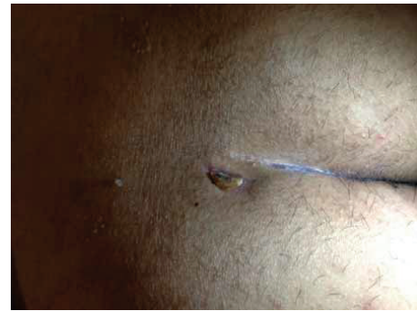
FIGURE 4: Three weeks after the operation, the reepithelialization was complete.

wound became fresh with minimal drainage. Then a 16# straight red rubber catheter with hospital vacuum system was used to assist the wound healing. The top of the catheter was cut into oblique shape and fixed by tape at the edge of the abscess wound. A 5 cm × 5 cm sterile cotton gauze was folded and put at both sides of the wound. Then 3 pieces of sterile gauze were put on the surface of the sinus cavity. A 15 cm × 15 cm antimicrobial incise drape (Ioban 2, 3M Health Care, MN, USA) covered catheter and gauzes for seal (Figure 3). The catheter was connected to a hospital vacuum system applied with continuous negative pressure (−30 kPa) to close the wounds. The dressing and catheter were changed and wounds were cleaned every 2 days. The 14# and 12# catheters were used in sequence to correspond to the size of the wound cavity. The vacuum assisted therapy was stopped until the wound cavity contract noticeably 1 week later and patient was discharged. Complete wound reepithelialization was obtained at 22 days postoperatively (Figure 4). Repeated ultrasound confirmed no track and sepsis at the natal cleft. The patient recovered well and remained asymptomatic for 12 months.