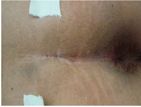
FIGURE 1: The complex pilonidal sinus with several openings and extended abscess.