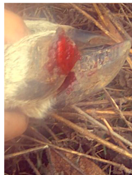
Figure 2. Pododermatitis in white-tailed deer 3 days before death.

In the month of October of 2020, seven deer died; this is considered a very short span of time for the deaths to be fortuitous. Furthermore, the deer that died presented similar symptomatology, which included hair loss, a tendency to limp, sudden prostration, and inability to escape from human proximity. The manifested symptoms were noticed for the first time two days before the first death. Some of the deer also presented pododermatitis (Figure 2). The pododermatitis lesions were treated with metamizole and trimethoprim-sulfamethoxazole, as well as local lavages with soap, water, and 5% copper sulfate (Supplementary Material Video S1). Before they died, the deer presented crystalline mucous running off from the nose, and lack of strength in the neck. The metamizole and trimethoprim-sulfamethoxazole treatment was administered again, and the animals that presented the symptoms were isolated in a room. Despite all measures, the deer that presented symptoms died.