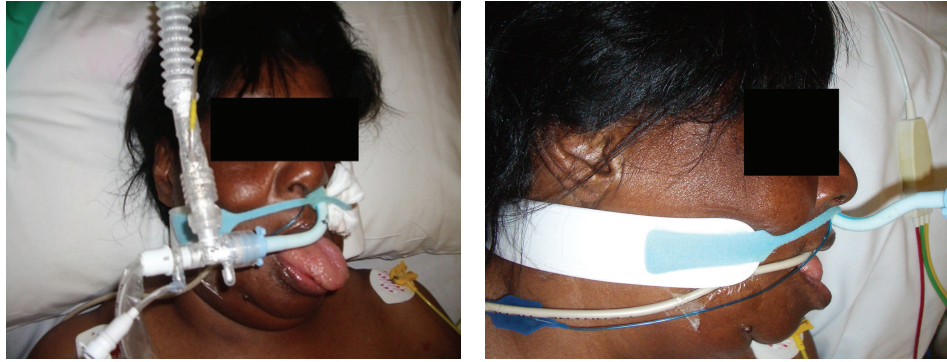
FIGURE 1: Before and after treatment with icatibant.

The patient was subsequently transferred to the Intensive Care Unit (ICU) for supportive management. After 72 hours there had been no resolution of symptoms despite regular administration of dexamethasone and chlorphenamine. After discussion with the immunology team it was felt appropriate to consider the off-license use of icatibant (Shire Human Genetic Therapies Inc.) for this patient, as the risks of continued intubation and ventilation were considered greater than the use of icatibant.