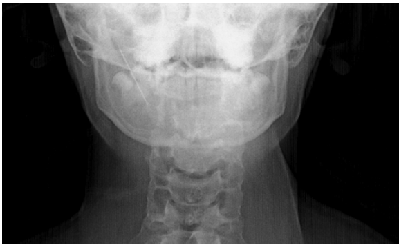
Figure 1 Anteroposterior cervical X-ray.