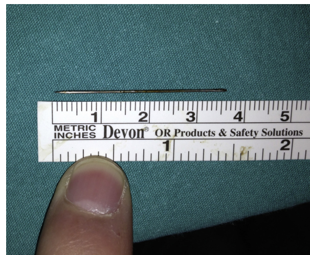
Figure 5 Extracted sewing needle (3.6 cm long).

chiatry and diagnosed as having a factitious disorder during follow-up.