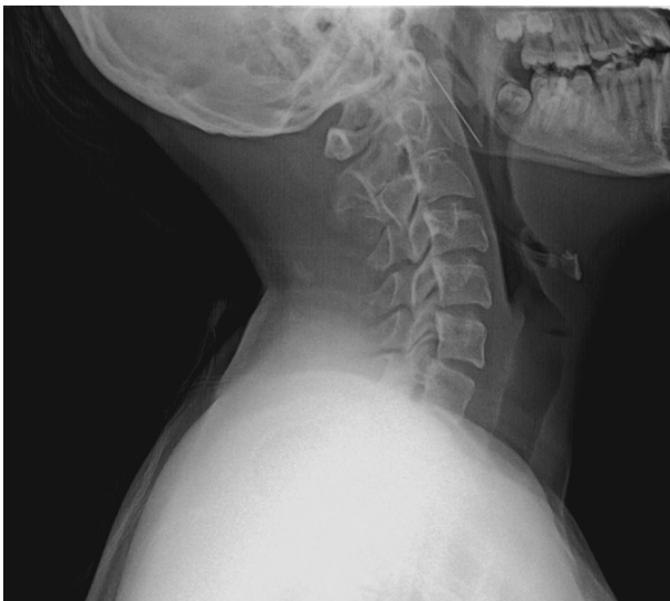
Figure 2 Lateral cervical X-ray.

The needle was found and removed without any complication (Figs. 4 and 5).