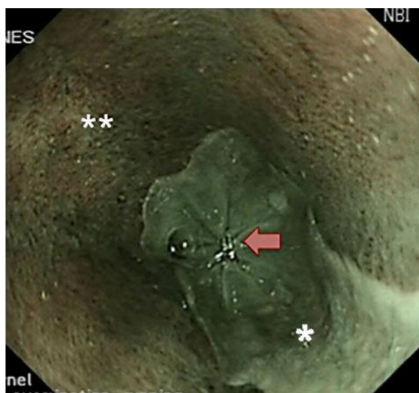
Fig. 2. Gastric heterotopia in the distal part of the esophagus. The whitish area is squamous epithelium (one asterisk), the salmon-colored area is columnar epithelium (two asterisks). Histopathologic examination showed acid-secreting, oxyntic-type, glandular, gastric epithelium (the picture was taken with narrow-band imaging). The arrow points at the gastroesophageal junction.