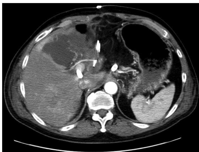
Fig. 3. CT scan on day 7 after aneurysm resection. Cholecystitis and hepatic infarction of medial segment of left hepatic lobe were confirmed.