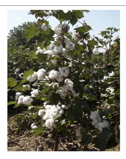
FIGURE 2 | The plant architecture of PHYA1 gene-derived and field grown (in 2013, Tashkent farm) novel RNAi cotton cultivar "Porloq-1" (translates as "Shiny-1" or "Great furture-1", Cotton Outlook, 2014). This cultivar has been developed through genetic hybridization and multi-generation individual selection from self-pollinated F<sub>2-5</sub> progeny of the sexual cross between somatically single-cell regenerated RNAi Coker-312 (T-1-7 RNAi family) and Uzbek cotton cultivar AN-Boyovut-2. RNAi of PHYA1 genes resulted in vigorous shoot and root development, bushy plant architecture, early flowering and increased boll number, early synchronous boll opening and early plant senescence with superior fiber quality parameters among other important morphological and agronomic improvements (refer to Abdurakhmonov et al., 2014 for fiber quality and yield increase details).

There are several positive ramifications associated with the anticipated usage of PHYA1 -dervied RNAi cultivars by farmers locally and globally that include: (1) opportunity to produce superior, novel RNAi cotton fiber that should have a premium price increase and income per acre, and (2) opportunity to spin a fine-count cotton yarn from any production zone. Furthermore, (3) early flowering and maturity of PHYA1 -derived RNAi varieties should provide an opportunity for early and