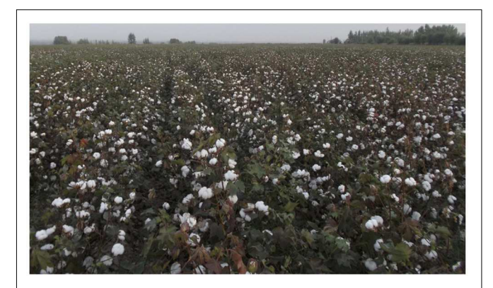
FIGURE 3 | A general view of large-field trial experimental plot in 2013 for novel Uzbek RNAi cotton cultivar "Porloq-2" derived from the sexual cross between RNAi Coker 312 (T-31 family) and Uzbek commercial Upland cultivar "C-6524" ("Mashhura-N" cotton, Namangan region, Uzbekistan). This field view demonstrates high-yield potential, early autumn induced rapid-senescence, and simultaneous boll maturity accompanied by increased anthocyanin pigmentation on stems and leaves of RNAi cotton plants under normal solar light condition.

quality crop harvest and on-time planting of rotation crops before harsh weather arrives, perfectly suitable and demanding for northernmost cotton growing country like Uzbekistan. RNAi cultivars have (4) increased seed cotton and lint yield per acre - the foremost target and interest of farmers. Most importantly, early observations and ongoing field experiments revealed (5) a better utilization of fertilizers and nutrients (due to increased nitrate reductase activity and strong root system), increased photosynthesis rate, and salt, heat and drought tolerance are added advantages of novel PHYA1 RNAi varieties. This sufficiently addresses the issue of problematic shortages in irrigation and water deficiencies triggered by forecasted global warming that remains a priority danger for the Central Asian regions (Abdurakhmonov, 2013). The use of cotton's own gene unlike other existing transgenic technologies of cotton, utilizing foreign genes, this state-of-the-art PHYA1-mediated RNAi technology assures (6) ecological safety of RNAi cotton cultivars. A high premium price of cotton fiber and increased yield should allow the expanded cotton production (7) on marginal land and create a new cotton fiber/cloth market; and (8) decrease in cotton planting area provides an opportunity to grow more food crops/plants that help to sustain world agricultural, food security and environment at the regional and global levels.