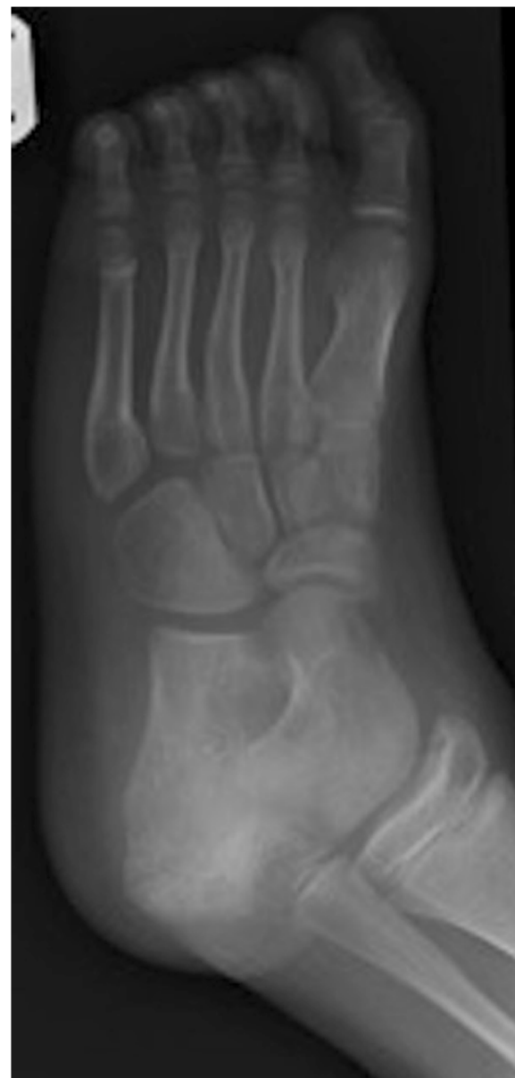
Fig. 2 Difficult examination due to patient distress. The foot and ankle has been held in a moderate degree of plantar flexion and internal rotation. Soft tissue swelling and posterior effusion is noted. Allowing even for the immature skeleton and positioning there appears to be significant widening of the subtalar joints and as this is the specific area of tenderness, bruising, inflammation, and some subtalar subluxation is suspected

Blood results revealed a white cell count (WCC) of 11.1 \times 10^9/L , neutrophils 8.0 \times 10^9/L , erythrocyte sedimentation rate (ESR) 68mm/hour and C-reactive protein (CRP) 198mg/L. An orthopedic opinion was requested, and he was promptly admitted for suspected osteomyelitis. A magnetic resonance imaging (MRI) scan of his left foot was obtained and it revealed osteomyelitis of the calcaneus bone and infection in the surrounding soft tissue (Figs. 3 and 4).