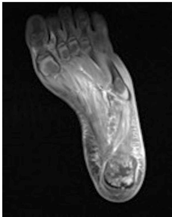
Fig. 4 Axial magnetic resonance imaging scan of the left foot with osteomyelitis of the calcaneum

Staphylococcus aureus was found to be responsible for the infection and, although community-acquired, it was