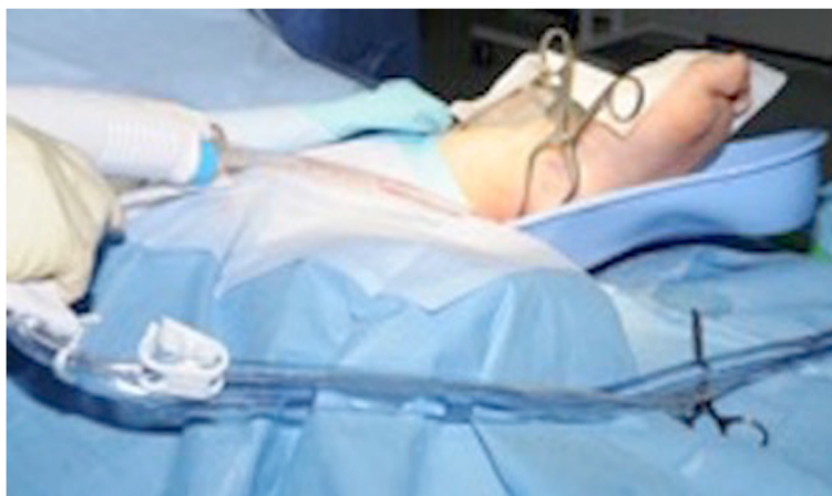
Fig. 7 Third look wound washout with normal saline

was sought, and a further 2.9 days until a diagnosis was established. Several other studies quote similar delays [2–6]. In our case there was a 10-day delay between presentation and diagnosis, with more definitive signs and symptoms developing later in the course. The diagnosis of calcaneal osteomyelitis should have been considered in this young patient presenting with heel pain at an earlier stage. Further imaging in the form of an MRI or bone scan when this patient initially presented would have clinched the diagnosis.