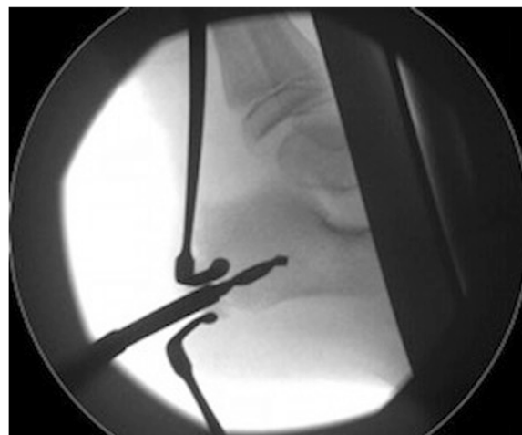
Fig. 6 Image intensifier used to guide drilling of os calcis in theatre

Cases of calcaneal osteomyelitis in the pediatric population often exhibit an indolent course, with presentations less dramatic than that of long bone osteomyelitis. Delays in diagnosis and initiation of treatment are common. One study of 60 cases of calcaneal osteomyelitis by Leigh et al. [1] reported an average of 6.8 days before medical advice