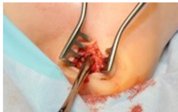
Fig. 5 Transverse incision above os calcis to drain pus

confirmed to be a Pantone-Valentine leucocidin (PVL)-negative strain. The patient continued his intravenously administered antibiotic regimen for a total of 2 weeks from the time of surgery, after which he was discharged home to continue with a 4-week course of flucloxacillin and fusidic acid administered orally. The blood results on discharge (3 weeks after admission) revealed a WCC of 5.4 \times 10^9/L , neutrophils 1.7 \times 10^9/L , ESR 18mm/hour and CRP <5\text{mg/L} .