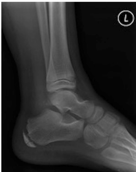
Fig. 1 Soft tissue swelling and tenderness is noted to the calcaneum. Modified technique has been applied. The calcaneal apophysis appears sclerosed and fragmented, but this can be a normal appearance in the developing calcaneum. There is suggestion of some widening of the talocalcaneal joint medially which may correlate with appearances noted at the subtalar joints on the ankle projections