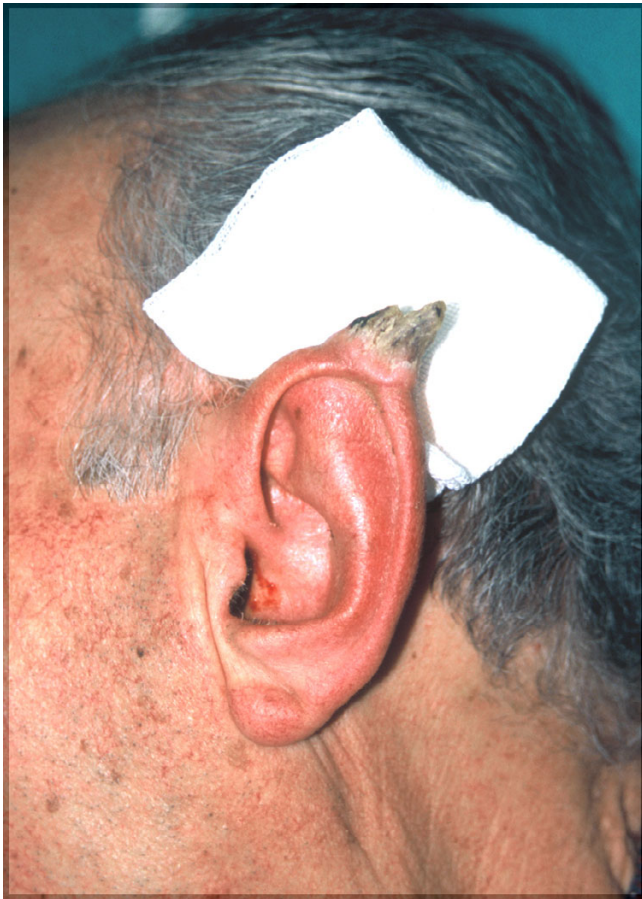
Figure 1 Cornu cutaneum on the left ear. Histologically lesion was reported as actinic keratosis.