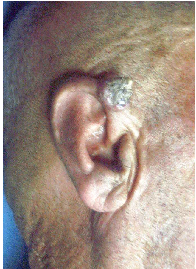
Figure 2 Cornu cutaneum on the right ear histologically reported as well differentiated squamous cell carcinoma.

cell tumor, sebaceous carcinoma or Kaposi's sarcoma). Most commonly, they are single and arise from a seborrheic keratosis lesion [8]. Largest study of 643 cutaneous horns was reported by Yu et al [6]. According to them 39% of cutaneous horns were derived from malignant or premalignant epidermal lesions, and 61% from benign lesions. Two other larger studies on cutaneous horn too showed 23–37% of these to be associated with actinic keratosis or Bowen's disease and another 16–20% with malignant lesions [3,9]. In the study of Bart et al [10] 44% patients had underlying malignancy. Three of their patients had past history of skin cancers [10]. Spira and Rabonovitz concluded that cutaneous horns in associated with a malignant or premalignant base is more common in patients with a past history of other malignant or premalignant lesions [11]. In our part of the country exposure to the sun is most common. Majority of the population is involved in farm activity mostly without sun protection. We believe that sun exposure is the most