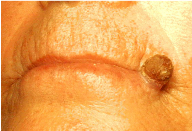
Figure 5 Cornu cutaneum on the lip due to actinic keratosis.

important etiological factor in pathogenesis of the cornu cutaneum like other skin lesions. Histopathological examination of the base of the lesion is necessary to rule out associated carcinoma, and full excision is the treatment of choice. In general, malignant or premalignant conditions are more common in older male patients, especially when the cutaneous horn is found on the face, pinna, dorsum of hands, forearms, or scalp, or when it has a larger base or base-height ratio [3]. Surgical excision remains the treatment of choice.