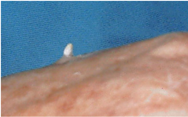
Figure 4 Cornu cutaneum on the hand due to keratoacanthoma.