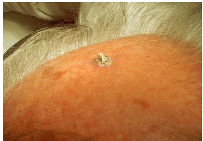
Figure 3 Cornu cutaneum due to solar keratosis of the scalp.

cell tumor, sebaceous carcinoma or Kaposi's sarcoma). Most commonly, they are single and arise from a seborrheic keratosis lesion [8]. Largest study of 643 cutaneous horns was reported by Yu et al [6]. According to them 39% of cutaneous horns were derived from malignant or premalignant epidermal lesions, and 61% from benign lesions. Two other larger studies on cutaneous horn too showed 23–37% of these to be associated with actinic keratosis or Bowen's disease and another 16–20% with malignant lesions [3,9]. In the study of Bart et al [10] 44% patients had underlying malignancy. Three of their patients had past history of skin cancers [10]. Spira and Rabonovitz concluded that cutaneous horns in associated with a malignant or premalignant base is more common in patients with a past history of other malignant or premalignant lesions [11]. In our part of the country exposure to the sun is most common. Majority of the population is involved in farm activity mostly without sun protection. We believe that sun exposure is the most