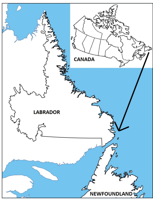
Figure 1 Map of Newfoundland and Labrador.

The data from other ecological studies suggest that the incidence rate of type 1 diabetes is significantly lower when the concentrations of zinc and magnesium in the domestic drinking water are in the range 22.27–27.00 mg/L (incidence rate ratio (IRR) 0.76; 95% CI 0.59 to 0.97) and >2.61 mg/L (IRR 0.72; 95% CI 0.58 to 0.91). 12-14 It has been also suggested that zinc, magnesium, calcium, chromium and to some extent copper, have a protective effect against developing type 1 diabetes. 11 12 15 16 Zinc is involved in cellular antioxidative defense and mostly found in the secretory vesicles of β-cells in the pancreatic islets. Magnesium is an essential cofactor helping insulin to bind to the insulin receptor. Therefore, lower serum zinc and magnesium are significantly associated with type 1 diabetes. <sup>17</sup> While all of these studies point to a possible connection to various elements found in water, the impact of water quality on the incidence of type 1 diabetes is still inconclusive.<sup>18</sup>