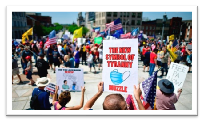
Figure 3.. A demonstrator holds a placard with a face mask stating, "THE NEW SYMBOL OF TYRANNY MUZZLE." People had gathered outside the Pennsylvania Capitol Building to protest the continued closure of businesses due to the coronavirus pandemic on May 15, 2020 in Harrisburg, Pennsylvania.<sup>110</sup>

II. The political mask: the face mask as a symbol of rights and freedoms. Is it a risk to one's freedom? (Table 3, Figure 3)