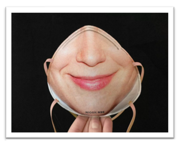
Figure 5. A San Francisco designer created "Resting Risk Face" masks by custom-printing the respirator masks with images of wearers' faces. It has been advertised as "be protective and be recognized. It's so easy." 111

The face and by extension face coverings, have always been constructed with both denotative and connotative meanings related to social communication. 64,65 In North America for example, 66 masks were constructed as barriers to communication during the pandemic because they jeopardized people's ability to judge facial expressions. 65,66 In contrast, the anonymity offered by face masks was presented as helping people to keep desired social distances in East Asian cultures, 67 where it is perceived as polite and modest not to show obvious emotions. 56,68 Face masks were used to send messages and carry messages throughout the pandemic. A dichotomy of being hidden versus being visible grew out of the face mask as stigma discourse. The common place use of masks in some parts of the world turned it quickly into a popular culture item. For example, Korean and Chinese celebrities often lead public fashion discussions on the face masks they wear. 69,70 Amidst the pandemic and with the broad adoption of masking around the world, face masks emerged as a new genre of fashion accessory, and an expression of personal style, and were sold by all clothing companies.<sup>71</sup> The U.S.based online marketplace Etsy says its total sales doubled in April 2020, mostly from face mask sales.<sup>72</sup> Masks were also turned into an object for political communication as protestors printed messages on their masks to march in response to George Floyd's death.73