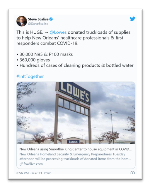
Figure 2 Lowe's announcing that large shipments of PPE are donated to the HCP. Large corporations such as Lowe's, Home Depot, and Target donated PPE to the hospitals and first responders."<sup>31</sup>