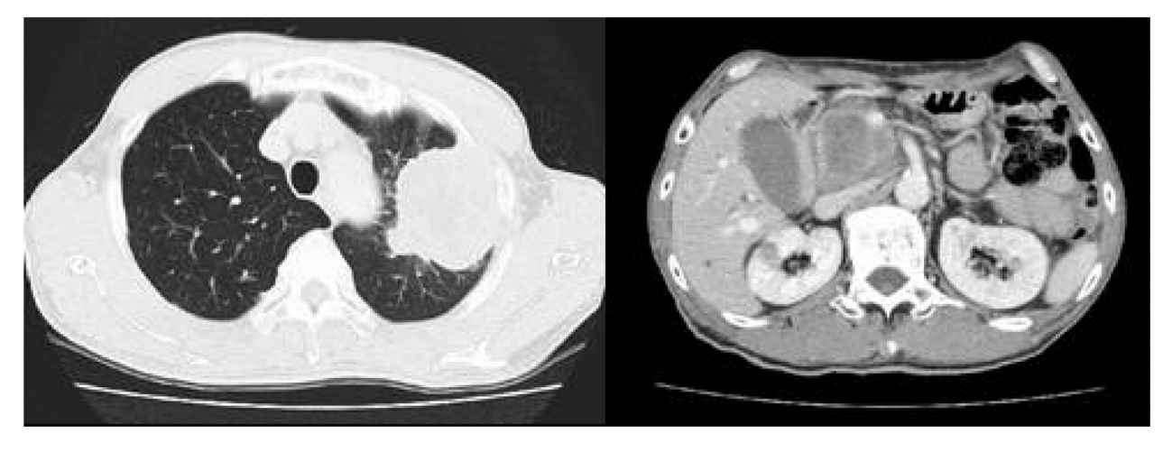
Figure I Tumors in the left upper lobe of the lung (left) and in the porta hepatic (right).

ultrasonography (US) and computed tomography (CT) demonstrated an extrahepatic bile duct obstruction by a tumor at the head of the pancreas (measuring 47 mm in diameter) and intraabdominal lymph nodes. Chest CT showed a lung tumor in the left upper lobe invading the chest wall and mediastinal lymph nodes swelling (Figure 1). A specimen of a transbronchial biopsy showed SCLC. Finally, he had a diagnosis of extensive stage SCLC (T3N1M1). Endoscopic retrograde biliary drainage (ERBD) relieved the jaundice. He thereafter received combination chemotherapy with cisplatin and topotecan after the level of T. Bil decreased to a normal range. He achieved a partial response with mild toxicity and had survived for 25 months without obstructive jaundice. At autopsy, the ERBD was still effective despite the progression of intraabdominal disease and the pathological specimen of a primary lesion of SCLC (Figures 2a, 2b) showed the same histology as that of the lymph node around the drainage tube (Figures 2c, 2d).