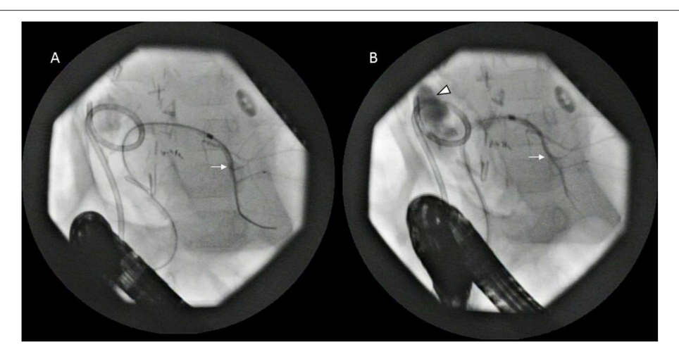
FIGURE 2 | Endoscopic retrograde cholangiopancreatography (ERCP)—the left biliary tree (arrow) is cannulated (A) which is well-demonstrated with contrast (B) including the extravasation at the hilum (arrowhead). The percutaneously placed pigtail drain is also seen.