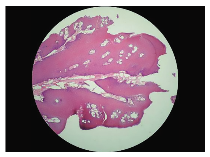
Fig. 3: Histopathological view showing proliferation of spinous cells in the form of finger-like projections containing a thin connective tissue core