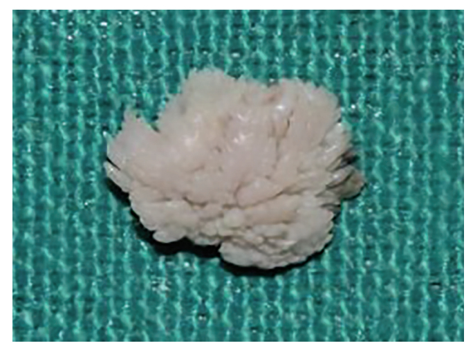
Fig. 2: Macroscopic view of excised lesion