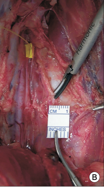
Fig. 1. Experiments of thermal injury of recurrent laryngeal nerve (RLN) induced by Harmonic ACE (Ethicon, a subsidiary Johnson and Johnson, Cincinnati, OH, USA) and Harmonic ACE+ (Ethicon, a subsidiary Johnson and Johnson) in swine model. (A) Harmonic ACE is activated at 2 mm from RLN. (B) Harmonic ACE+ is activated with direct contact to RLN.