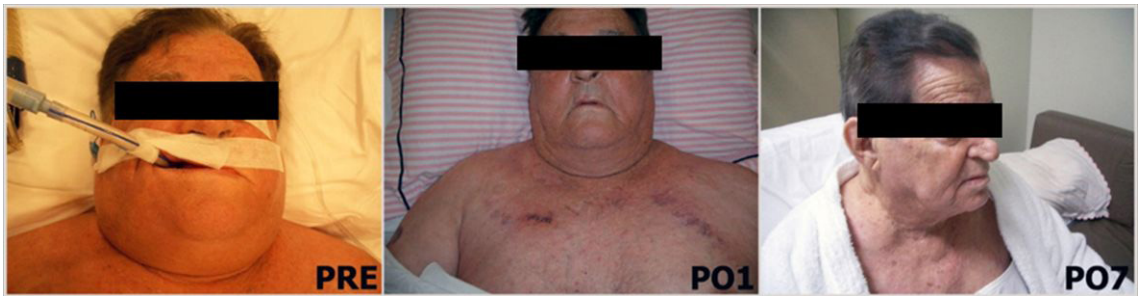
Figure 3. 73-year-old patient before intervention (PRE); and one (PO1); and seven (PO7) days after intervention.