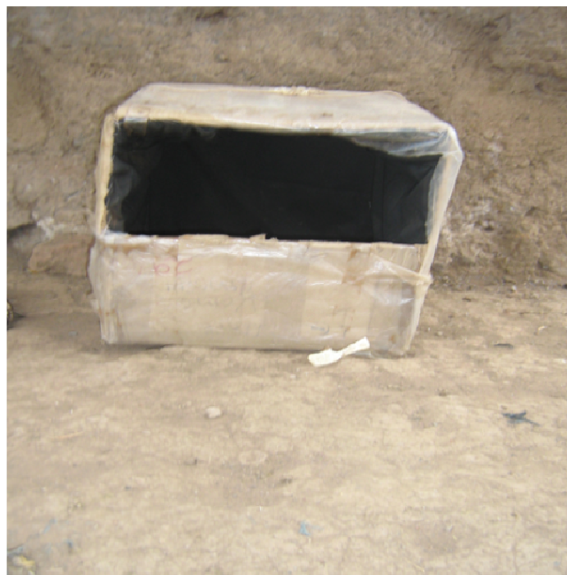
Figure 1 Photograph showing the position of the box trap outdoor for An. arabiensis sampling.

Black cotton clothing material was soaked in fresh cow urine in the morning. It was then kept in a plastic bag in a freezer till experiment time after been dried to reduce wetness. Some fresh cattle urine was collected by a person in a cowshed from a urinating adult female cattle. The cloth-