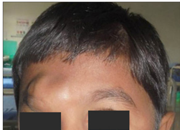
Figure 1. Clinical photography showing a large lesion over the right supra-orbital region covered by normal and healthy skin.

Infantile hemangiomas are the most common benign tumors of infancy and childhood with a reported incidence of 4% to 10% in infants [1]. The majority of them are located in the head and neck region [2]. A 9 year-old male child presented with a history of progressively increasing swelling over the right eyebrow region. The lesion was present since childhood; however, it increased in size over the previous 3–4 months. The lesion was not associated with pain. There was no history of trauma, fever, headache or seizures. There was no history of visual disturbances. Local examination revealed a 3×3 cm, soft, fluctuant swelling over the right eye brow region (Figure 1). The swelling was non-pulsatile and there was no bruit. Skin over the swelling was healthy and there was a palpable depression over the right supra-orbital ridge. The trans-illumination test was negative. The CT scan showed scalloping over the right supra-orbital ridge with an intact bone (Figure 2). An initial diagnosis of calvarial hemangioma was made. Because the parents feared that accidental injury can lead to a rupture of the lesion and as the lesion was growing in size, a decision to excise the lesion was made. The child underwent a total excision of the lesion. Intra-operatively, there was smooth scalloping of the right frontal bone (Figure- 3). Histopathology confirmed the diagnosis of infantile hemangioma. The child was in good condition on one-year follow-up.