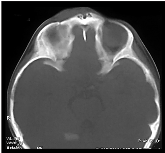
Figure 2. CT scan of the brain (bone window) showing a hypodense, well-defined extracranial swelling over the right supra-orbital region producing a characteristic "scalloping sign".

and calvarial region (including scalp dermoid, sebaceous cysts, lipomas, hemangiomas, anterior meningoencephalocele, cephalhematoma, subgaleal hematoma, lymphangioma, sinus pericranii and abscess) need to be considered in the differential diagnosis of scalp hemangioma in children [7–11]. Based on clinical presentation and examination, scalp infantile hemangiomas (which are usually soft and non-pulsatile masses) can be differentiated from other lesions [4,12]. Computerized tomography (CT scan) with in the bone window is the most appropriate investigation to see the details of the scalp and calvarial lesions (intra-cranial versus extra-cranial location and extent) and to help decide on subsequent management [8,9,13–15]. A