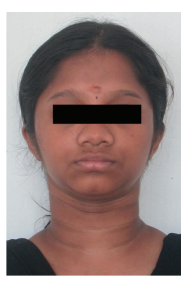
FIGURE 3: Extraoral photographs.

Since the patient's main complaint was missing incisor, she was not interested in getting orthodontic treatment