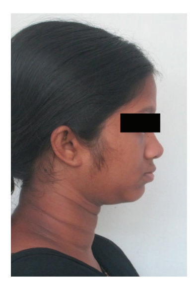
FIGURE 5: Extraoral photographs.