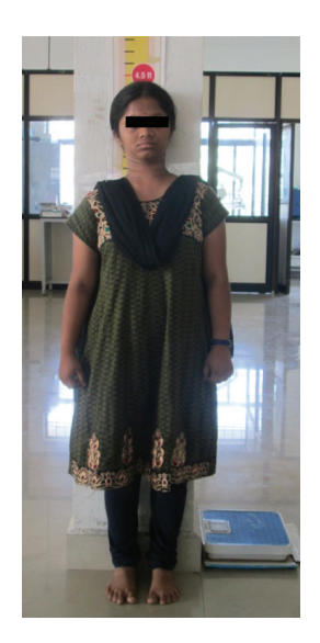
FIGURE 1: Height of the patient.