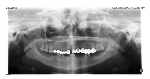
FIGURE 10: Mother's OPG revealing short conical roots.