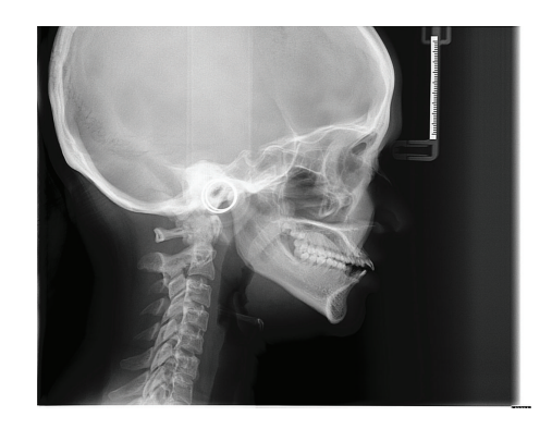
FIGURE 11: Lateral cephalogram of the patient.

Sheng and Westphal [22] and Kjær and Fischer-Hansen [23] found that the pituitary gland develops before the cartilaginous sella turcica has been formed. O'Rahilly and Müller [24] reported that the hypophyseal cartilages fuse around the existing hypophysis to form the body of the sphenoid bone containing the hypophyseal fossa. The thyroid stimulating hormone is secreted by the pituitary around the 15th week of intrauterine life. It is at this time that the cartilaginous precursor of the sella is first noticed in the foetus [25]. This fact that the pituitary gland starts functioning even before the cartilaginous precursor of the sella is being formed favours our hypothesis.