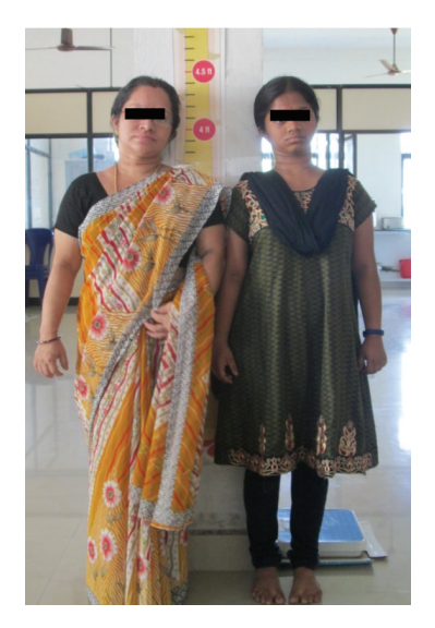
FIGURE 2: Patient and her mother of similar height.