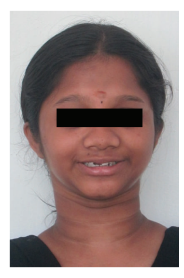
FIGURE 4: Extraoral photographs.