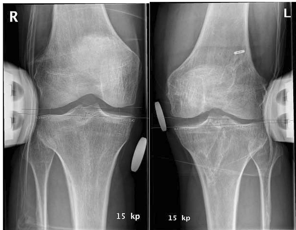
Fig. 2 Valgus stress radiographs taken with knee in 20° flexion of uninjured and injured knees 3 years after bicruciate reconstruction (left knee) with Telos device on a patient with proximal grade-III MCL rupture. Telos radiographs show a 2.2 mm side-to-side difference, representing a good radiological outcome

In the current study, the aim was not to make any statistical comparison between the results of conservative treatment of proximal and midsubstance MCL injury and surgical treatment of distal MCL injury and power analysis is not applicable. For applicable analysis SPSS 24 (IBM Corp. IBM SPSS Statistics for Macintosh, Version 24.0. Armonk, NY: IBM Corp.) was used.