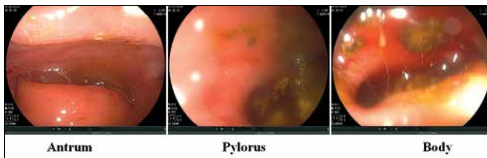
Figure 2: Gastric endoscopy showing food remnant in proximal pylorus