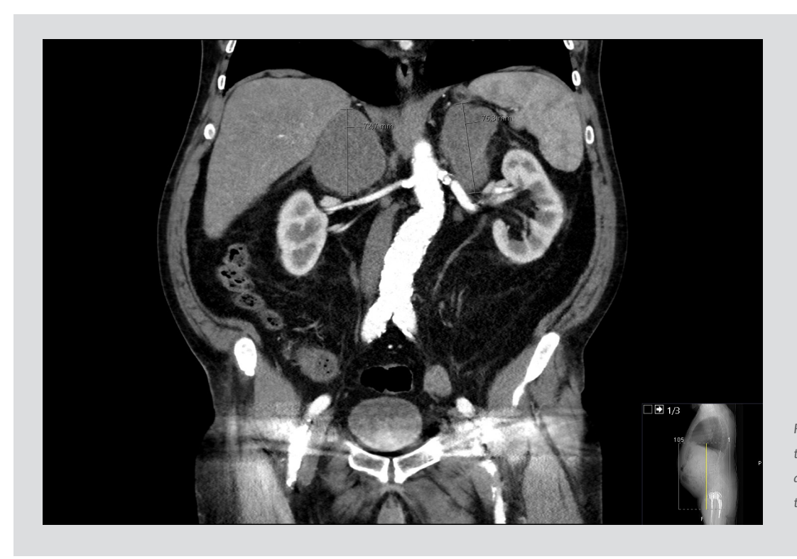
Figure 1. Contrast-enhanced computed tomography (coronal view) of the abdomen and pelvis showing bilateral enlargement of the adrenal glands

Several abdominal ganglion formations were also observed, the larger ones at the proximity of the right adrenal mass, causing significant extrinsic compression of the inferior vena cava. Pulmonary embolism was ruled out.